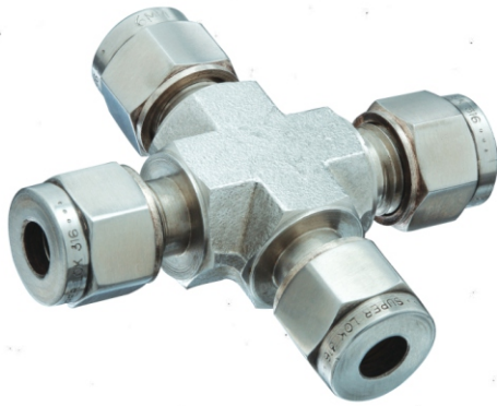
Dimensional Details :